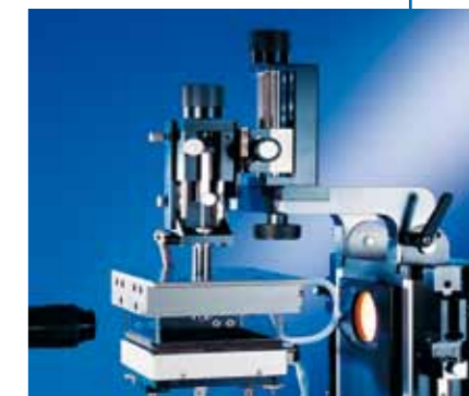
Needle heating device NHD 400 with an electrical temperature control unit TEC400