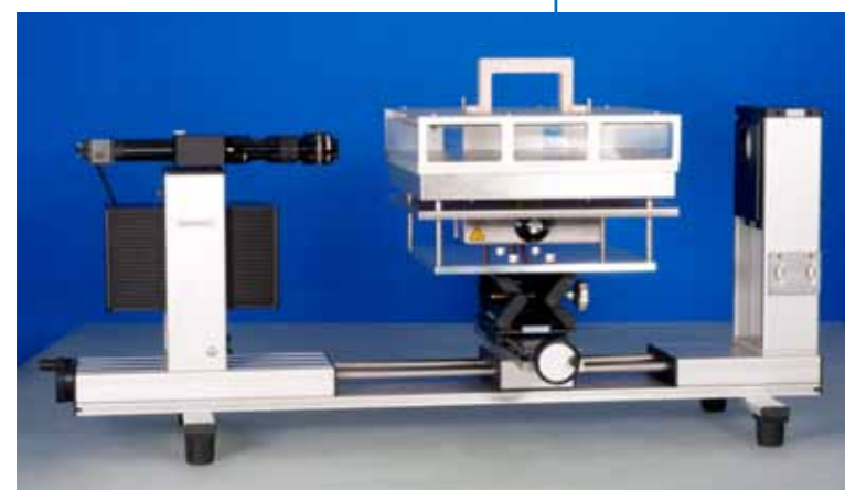
OCA 20XL with TEC 300XL