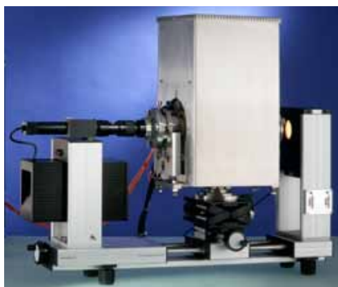
OCA 20LHT with high temperature furnace HTFC 1800