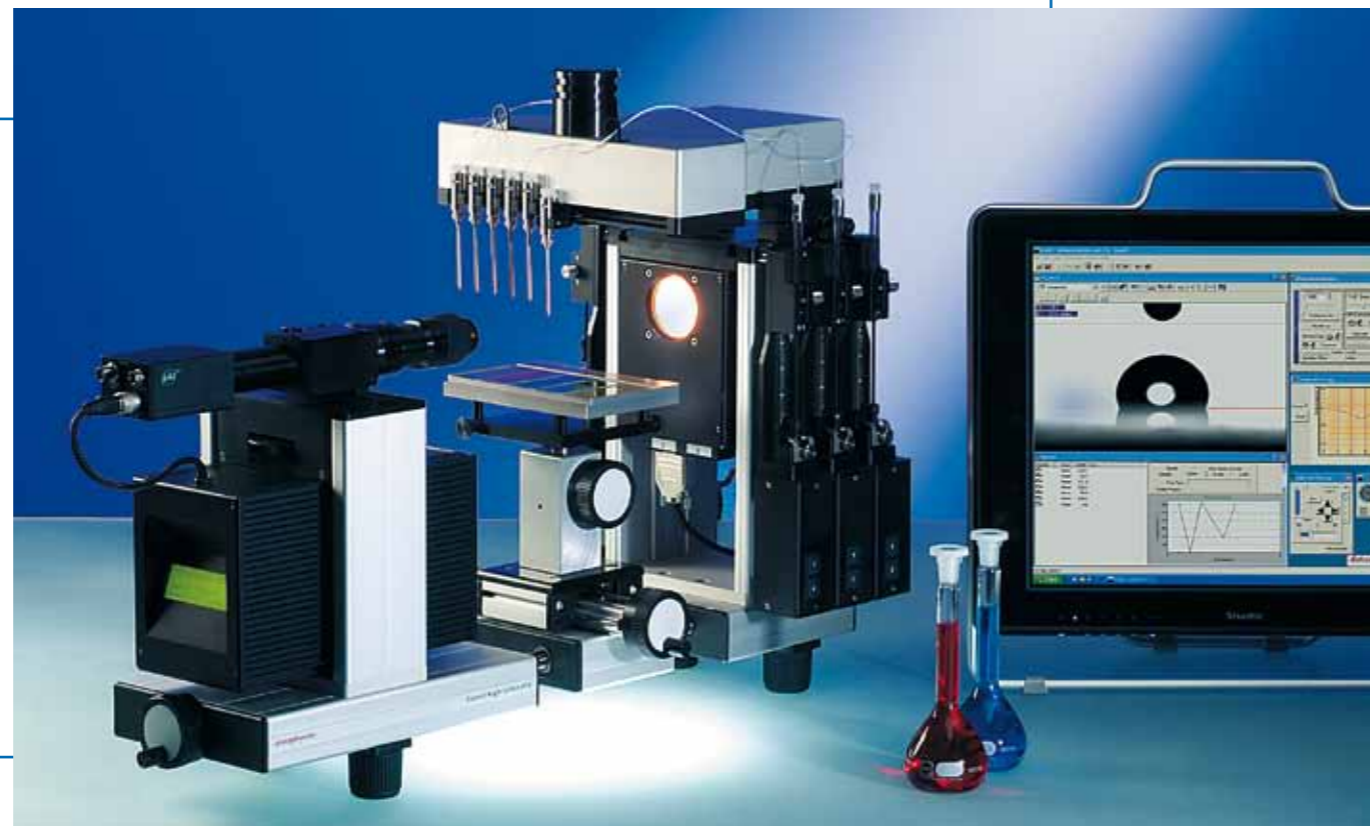
OCA 20/6 with electronic multiple dosing system E-MD/6 and high-speed video-system UpOCAH